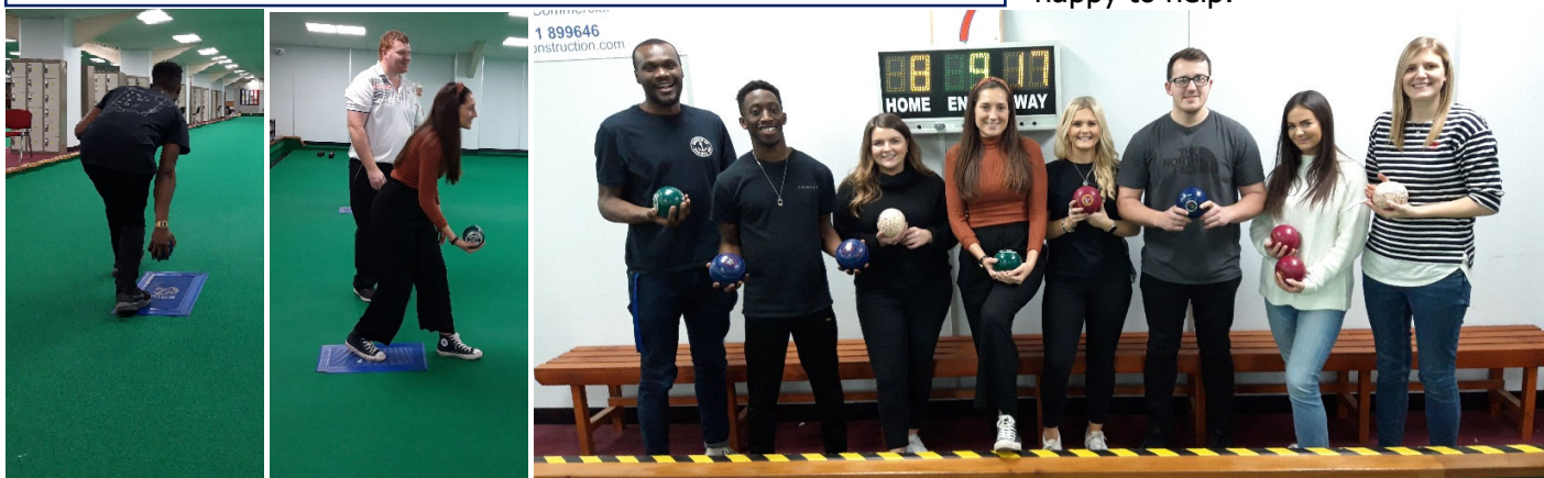
Below: Leicester City in the Community Team at Slater Street